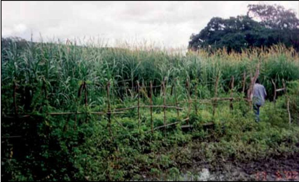
Photo 7 – Aspect of Economic Exploration in the Hydrographic Basin of an Underground Dam