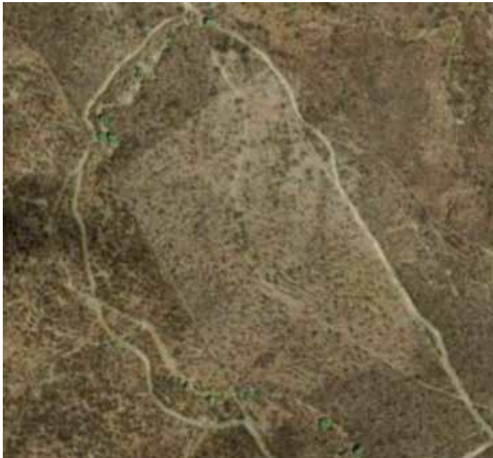
Photo 15 – Air View of Agrosilvopastoral System Area in Cangati River HMB, Canindé-CE