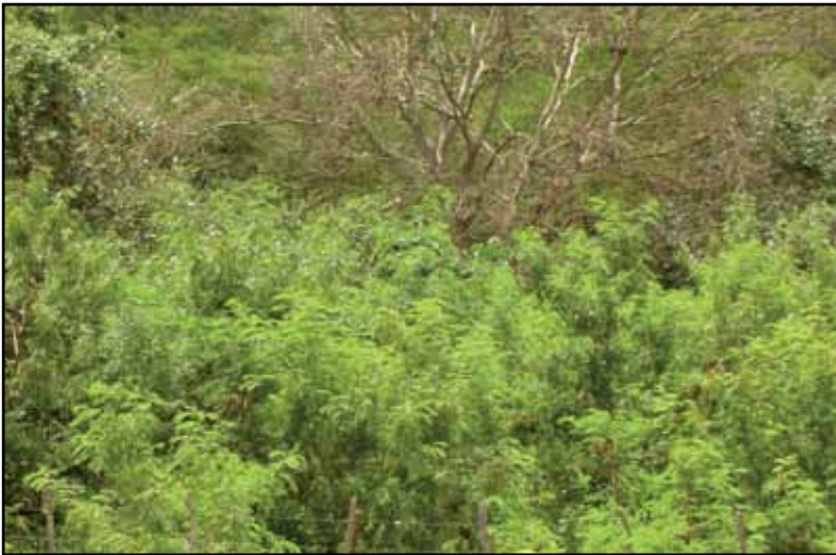
Photo 1 - Aspect of Semi-arid Region during Dry Period and Rainy Season