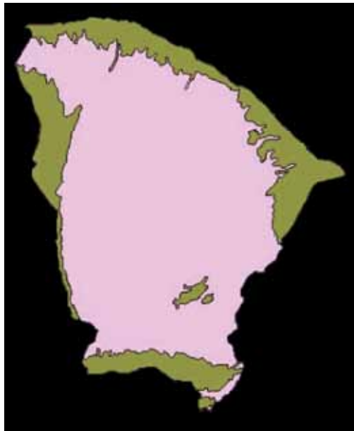
Map 1 – The State of Ceará and its Geological Configuration. Crystalline Soils are In Central Area, while Sediments (State Edges) are in all Other Areas

The State of Ceará covers a surface area of 148,016 km 2 , populated by some 8.55 million inhabitants, according to estimates by the Brazilian Geography and Statistics Institute (IBGE) for 2009, more than 70% of which live in urban areas, corresponding to a demographic density of 57.7 inhabitants/km 2 , which promotes a great anthropic pressure on the environment. In that same area, the combination of irregular precipitation regime with a high predominance of crystalline soils occupying some 75% of the State surface area (Map 1) determines that all its rivers are intermittent and may dry up in low precipitation years; in normal years, such rivers flow only during the rainy season.