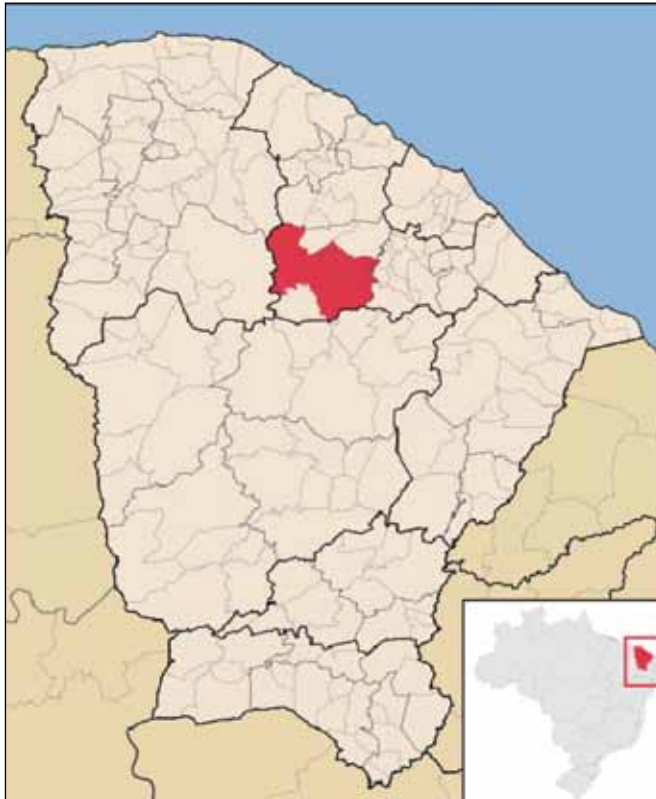
Map 2 – Location of the Municipality of Canindé-Ceará-Brazil

Diagnosis or baseline called “Global Socioeconomic Analysis of Hydrographic Basin” was determined for all selected hydrographic microbasins. However, socioeconomic monitoring and evaluation were performed only in Cangati River hydrographic microbasin, as it was selected to be the pilot microbasin in the Project. Accordingly, it was in that HMB where PRODHAM actions were given a higher priority, intensified and systematically evaluated, providing a substantial documentation of “underway” evaluation. Because of such characteristics, evaluations and suggestions included in this book refer essentially to works developed in Cangati River HMB, in the district of Iguaçú, Canindé-CE. Site maps of that microbasin are shown below. (Maps 2 & 3).