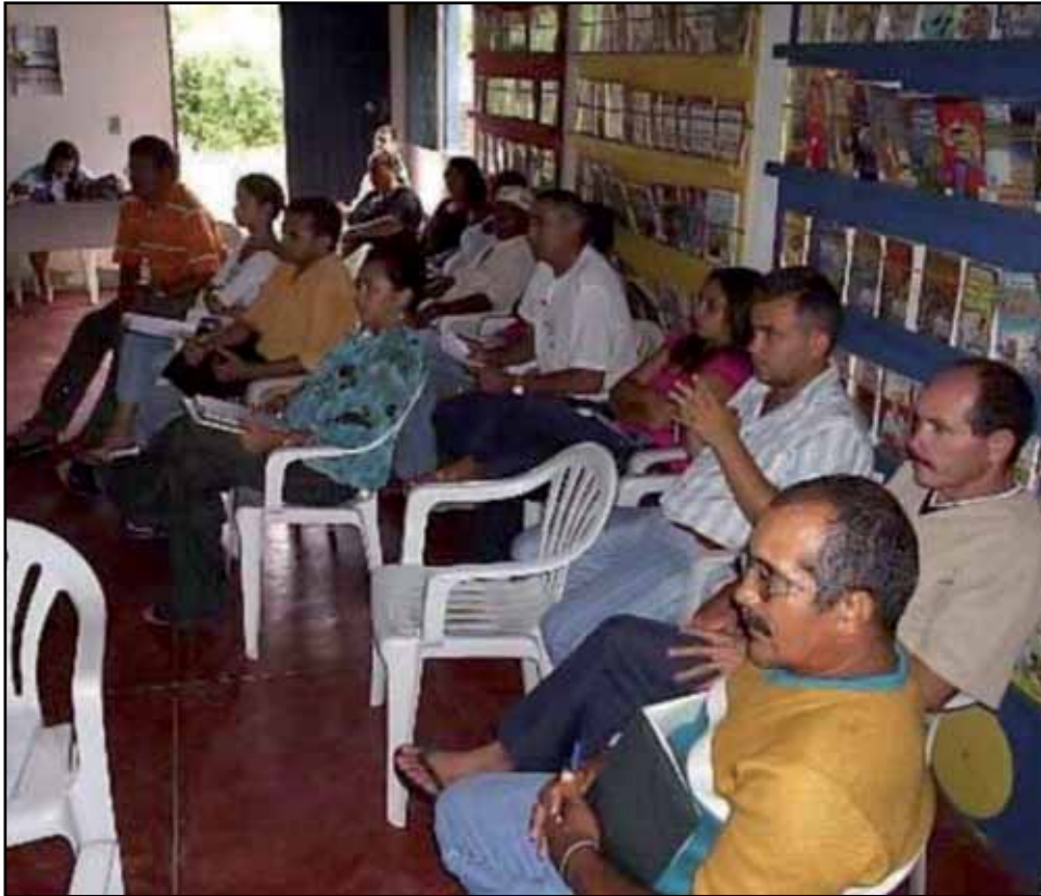
Photo 26 - Meeting of the Management Committee of Salgado/Oiticica Stream HMB

A local population' positive attitude to the care with waste and the best way to recycle it was also disseminated. Non-deforestation and replacement of ciliary forest have become a habit in Iguaçu community.