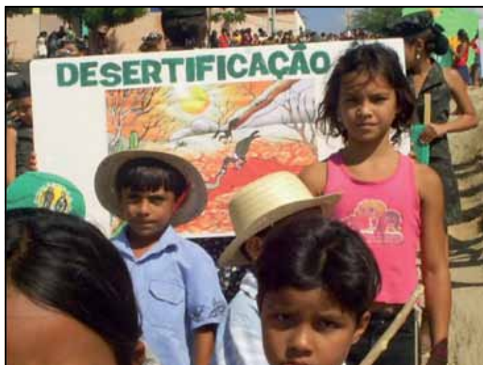
Photo 28 - Detail of a Commemorative Event Involving Children

Meetings with community members addressed the occurrence of many previous discussions on waste destination, but even so the practice of giving the waste inadequate destinations still persists. Community members consulted about this matter acknowledged that they used wrong practices, but continue to use them in the absence of other options.