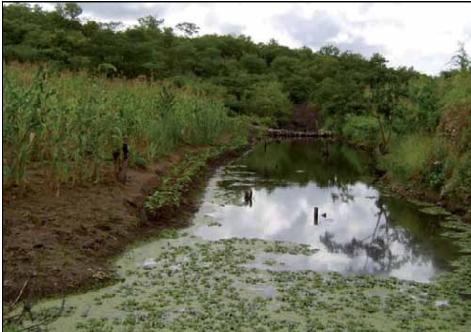
Photo 5 - Aspect of Sediment Retaining Dam and Agricultural Exploration Upstream to Dam.

PRODHAM action involving the successive dams allowed the recovery of part of Cangati River HMB, specifically in previously dry grottos, which are now recovered and humid. There were changes in soil structure, including a gradual productivity increase, reduced surface runoff and soil loss as a result of erosion reduction, reappearance of water sources and several flora and fauna species.