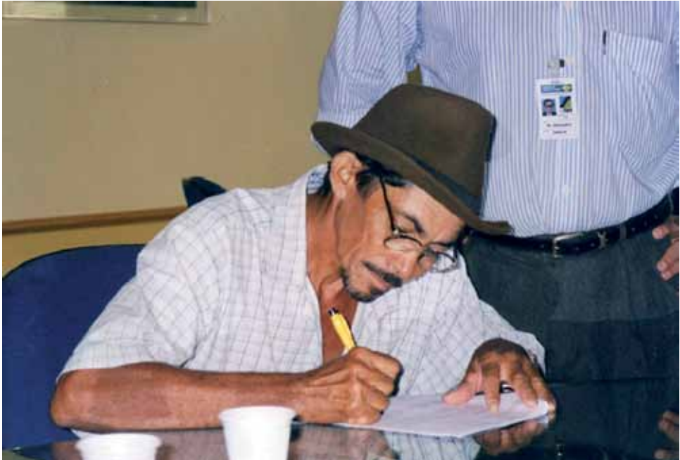
Photo 18 – Signing of Agreement between SRH-CE and Iguazu Community Association, Canindé-CE

For this component replication in other microbasins, the observance of all recommendations learned from PRODHAM experience is critical, with special attention to participatory planning, to avoid problems referred to above. Even the selection of microbasin to be assisted should be quite judicious.