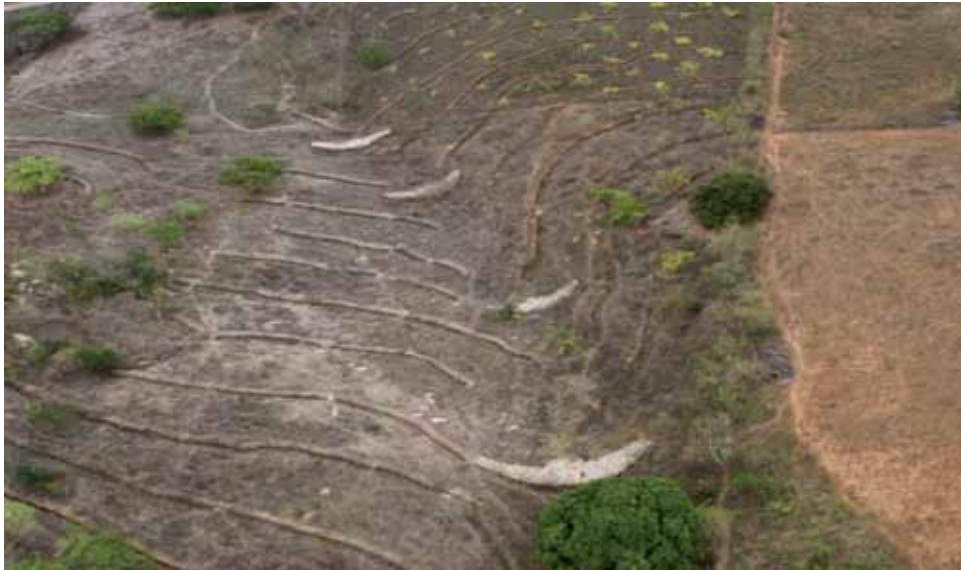
Photo 4 – Air view of a Series of Dams and Surrounding Stone Barriers in Dry Period (Summer), in a HMB assisted by PRODHAM

Sequence of successive dams and progressive terracing allows the real possibility of resurgence of micro and meso flora and fauna. Over the years, if we could have an air view of a microbasin provided with successive dams, its image would resemble a dry leaf with several green veins cause by moisture. In Cangati River microbasin the appearance of water springs is noted, while in the most humid microbasin (Pesqueiro River Microbasin in Aratuba), small streamlets that existed in the far past reappeared as a result of successive dams constructed under the Project.