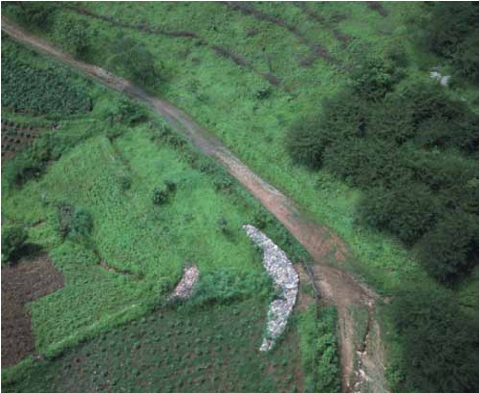
Photo 10 – Air View of Cangati River HMB showing Vegetation Remains Row, Surrounding Stone Barrier, Successive Dam and Contour Line Cultivation Techniques.

For Cangati River microbasin areas, all such techniques were successfully used, as shown by Photo 10.