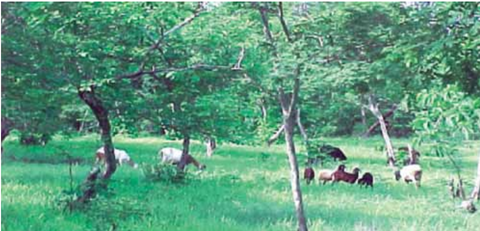
Photo 13 – Sheep Grazing in an EMBRAPA Experimental Agrosilvopastoral System Area.

Agrosilvopastoral exploration system was developed by Empresa Brasileira de Pesquisa Agropecuária (EMBRAPA – Caprinos e Ovinos) with the objective of offering the family producer a cost-effective option to obtain income from a productive area by performing joint activities, such as agriculture, breeding of small animals under grazing regime, and maintenance of part of brushwood reserve base don the preservation of sizeable vegetation. The system uses the actual brushwood area to compose the forage support to the property, by making some manipulations with the introduction of leucaena and other cultivated leguminous plants. This way of exploring the area is quite favorable to small family producers, as more recent studies by EMBRAPA Caprinos e Ovinos suggest that the generated income is sufficient to support a family at conditions that are worthier than those prevailing in the present days.