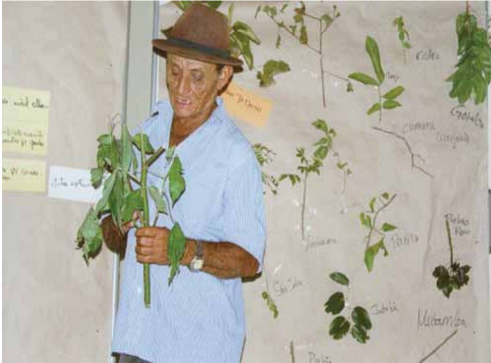
Photo 19 – Aspect of an Activity Used in an Event on the Environment held in Cangati River HMB, Canindé-CE