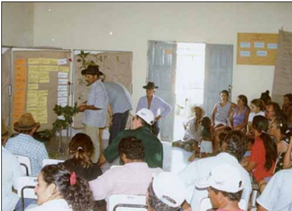
Photo 25 – Organizational Capacity Building Event in Iguaçu, Canindé-CE

By this process, the Project qualified more than 400 workers specialized in hydroenvironmental work construction. Such workers’ learning was made possible by the implantation of large stone barrier areas, terraces, underground dams, successive dams, rain cisterns, in addition to recovery of rural roads and ciliary forest.