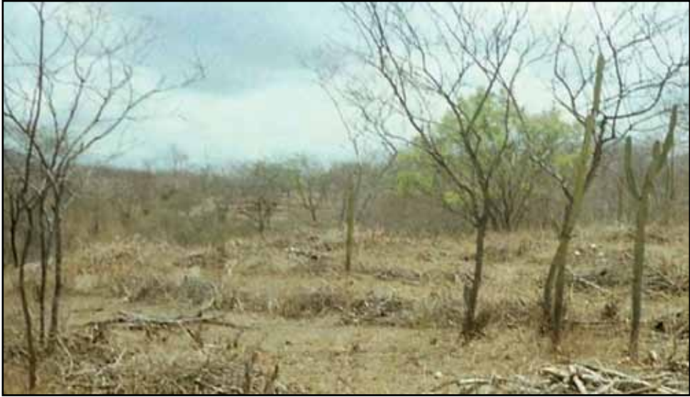
Photo 14 - Brushwood Thinning at an Experiment of Agrosilvopastoral System in a Property in Cangati River HMB, Canindé-CE