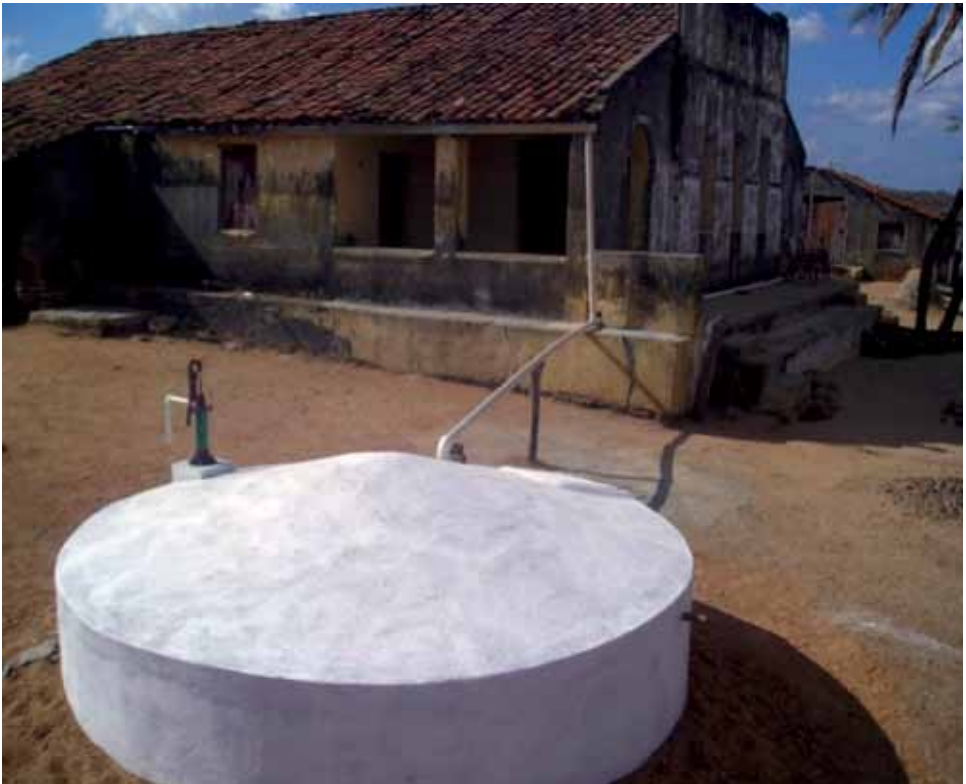
Photo 17 - Rain Cistern Constructed by PRODHAM

of the benefited family with respect to the cistern is to provide the excavation of storage tank foundations for cistern construction, as all the rest is under PRODHAM responsibility. In such a case, initially many families were not willing to excavate the hole and therefore were not beneficiaries of the work. Later, after being aware of the great benefit provided by the cistern, they agreed to make the excavation and benefited o the work.