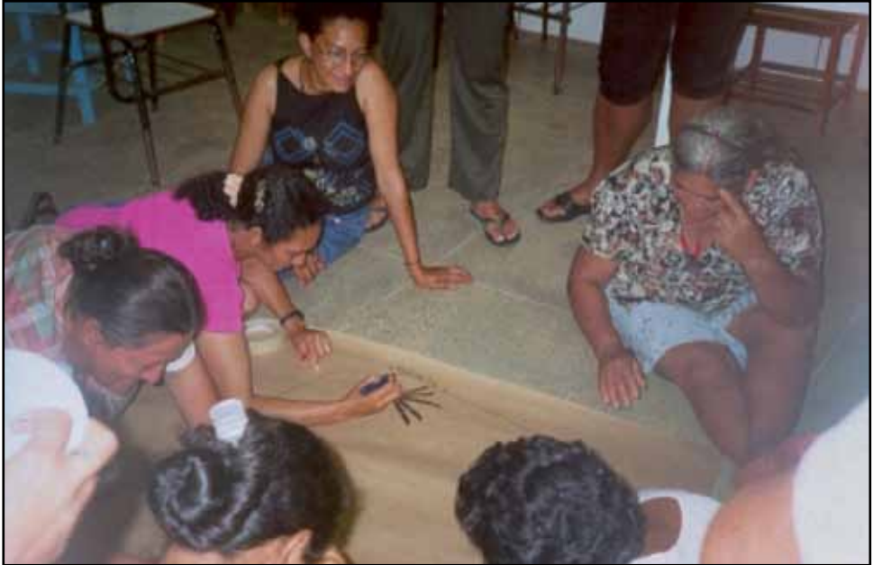
Photo 3 – Aspect of Event of Involvement of Women in PRODHAM Strategic Discussions.

Simple reforestation actions in urban areas and ciliary forest, selective waste collection, composting, adequate handling and use of water resources available for human consumption (cisterns, wells, etc.), domestic animal management, change of inadequate agricultural practices, and adoption clean technologies, among others, were encouraged.