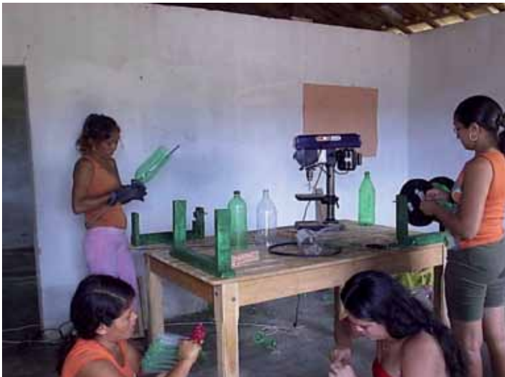
Photo 22 – Youngsters Working in a Factory of Recyclable Plastic Brooms ( pet ) in a Community Assisted by PRODHAM

Plastics are polymers produced by petrochemical processes. Pet (ethylene Polyterephthalate) is one of them, which was developed in 1941. Because it is an inert, light, resistant and transparent material, it began to be used in the manufacture of beverage and food packing in the 1980s. Brazil currently produces some three billion pet bottles. This is a 100% recyclable product, but currently the recycling volume is around 50%. This means, in practice, that at least one and a half billion of non-biodegradable plastic bottles are discarded in the environment every year, taking hundred of years to be absorbed by nature. (WIKIPEDIA, 2009).