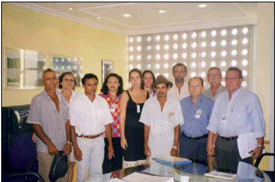
Photo 27 – PRODHAM Managers and Technicians and Iguaçu District Leaderships Attending an Organizational Strengthening Event

After the signing of the agreement with Iguatu Association, the capacity building of its leaders was scheduled (see Photos 26 and 27), with emphasis on the matter of account control supported by accounting courses. In addition to courses, several activities were performed by the association, provided that no actions were taken without the involvement of its board and members.