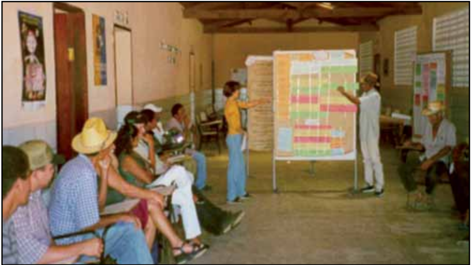
Photo 20 – Detail of a Capacity Building Event Involving the Community Assisted by PRODHAM

As a suggestion for PRODHAM environmental education replication in other microbasins in Ceará semiarid region, it can be said that such practice was the base for PRODHAM success, and therefore there is no restriction to the component replication in other microbasins in Ceará semiarid region.