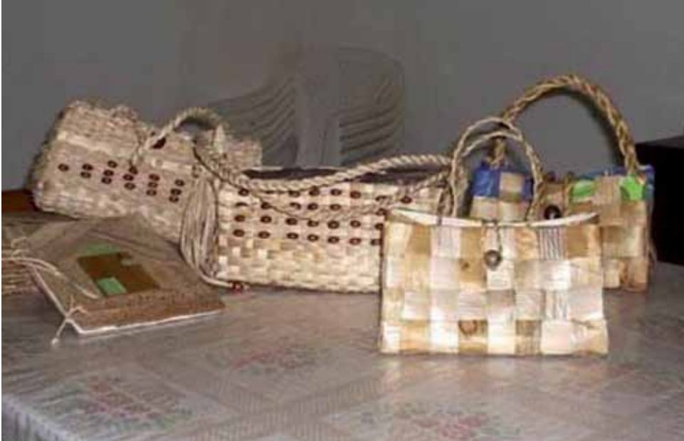
Photo 23 – Craftwork Products Made of Banana-Tree Straw, Pacoti-CE