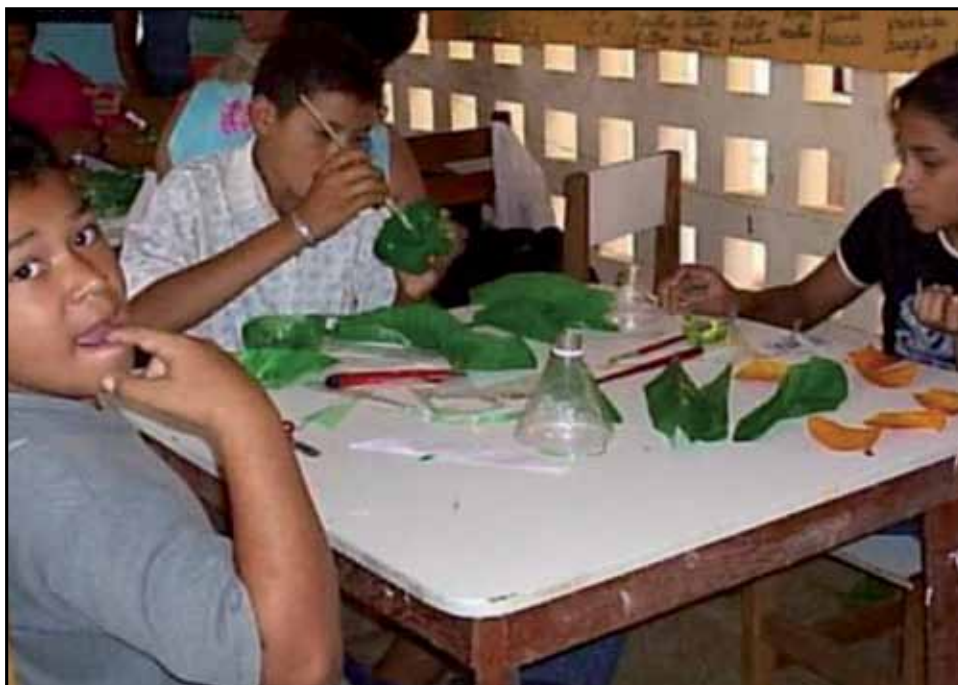
Photo 24 – School Children’s Sensitization in pet Bottle Recycling Training in Canindé-CE

The HMB started to adopt the sustainable procedure by following a world tendency of reutilization of pets from domestic waste to manufacture new objects through recycling process, what has represented an economy of raw material and energy. This way, concept of waste tends to be modified to be understood as “things that can be useful and reusable by man.”