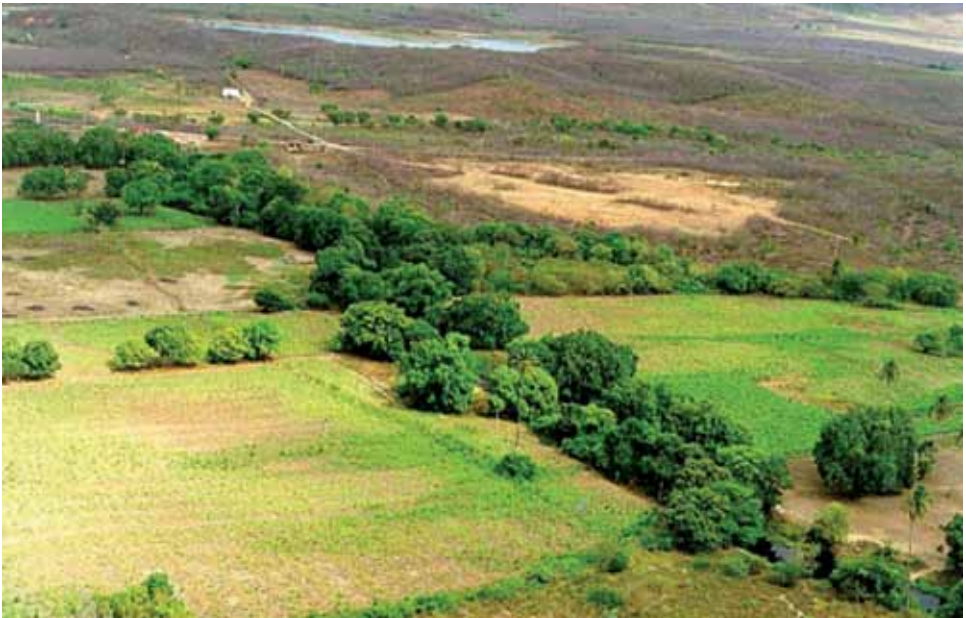
Photo 11 – View of a Section of Cangati River and its Ciliary Forest

Expected effects of ciliary forest reintroduction are forest protection from river silting-up to prevent floods and open spaces for biodiversity recovery with the resurgence of meso and micro fauna and flora. In addition, it aims to prevent soil loss during flood periods, like that occurred in Cangati River in 2004. During focal group meetings, local producers stressed the important role played by ciliary forest when Cangati River was hit by a great flood in 2004. The reforested area resisted well to water strength. In some areas, water was as high as tree tops. But even so, neither vegetation nor the soil where it was planted was destroyed.