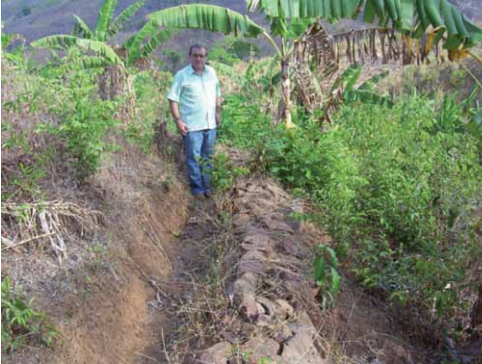
Photo 9 - Detail of a Surrounding Stone Barrier in Pacoti-CE