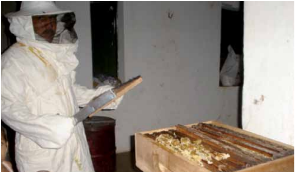
Photo 21 – Beekeeper at Honey Collection Activity in Iguaçu Community, Canindé-CE

One of beekeepers started to construct its own beehives and sold them to other beekeepers in the region. The Association has Honey House, where centrifugation, filtering and bottling are made.