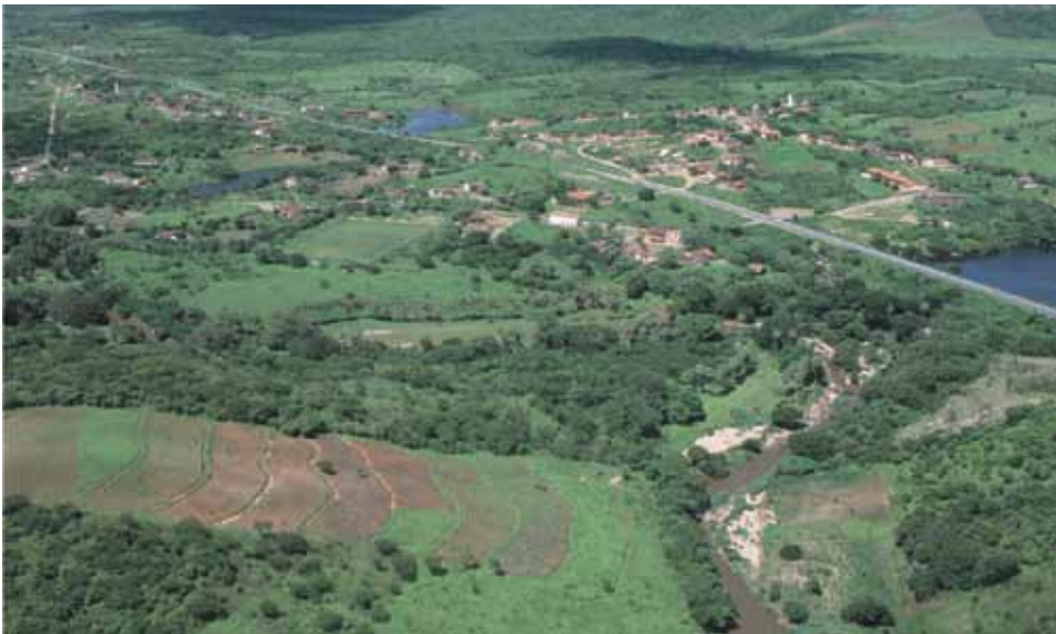
Photo 2 - Air View of Iguaçu Community in Canindé-CE