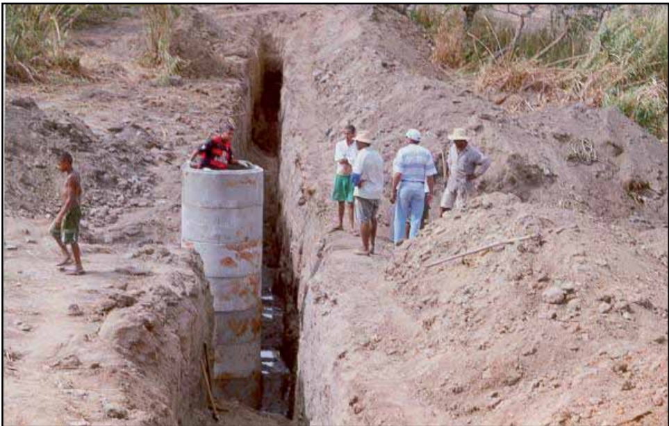
Photo 6 - Aspect of an Underground Dam under Construction

Expected effects of this component are water storage in artificial aquifers to meet water needs in rural environment, especially for vegetal and animal consumption. Increased water in soil is sufficient to meet water needs of crops, thus enabling agricultural exploration by family farmers all over the year. Under such conditions, it promotes a significant increase of annual crop exploration, including grasses, tubercles and fruits in its hydrographic basin.