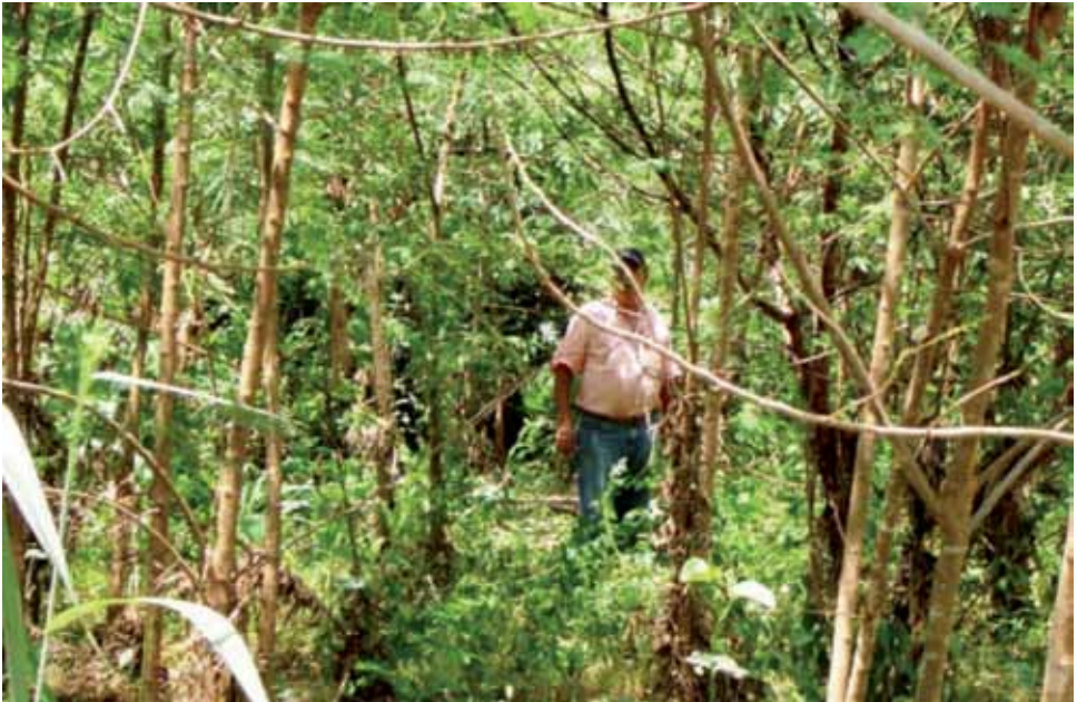
Photo 12 – Aspect of Reforestation in the Riparian Zone of Cangati River in Canindé-CE

It is indispensable that the area selected for ciliary forest replacement is fenced to prevent animals from eating the seedling plants at least until they reach an ideal size.