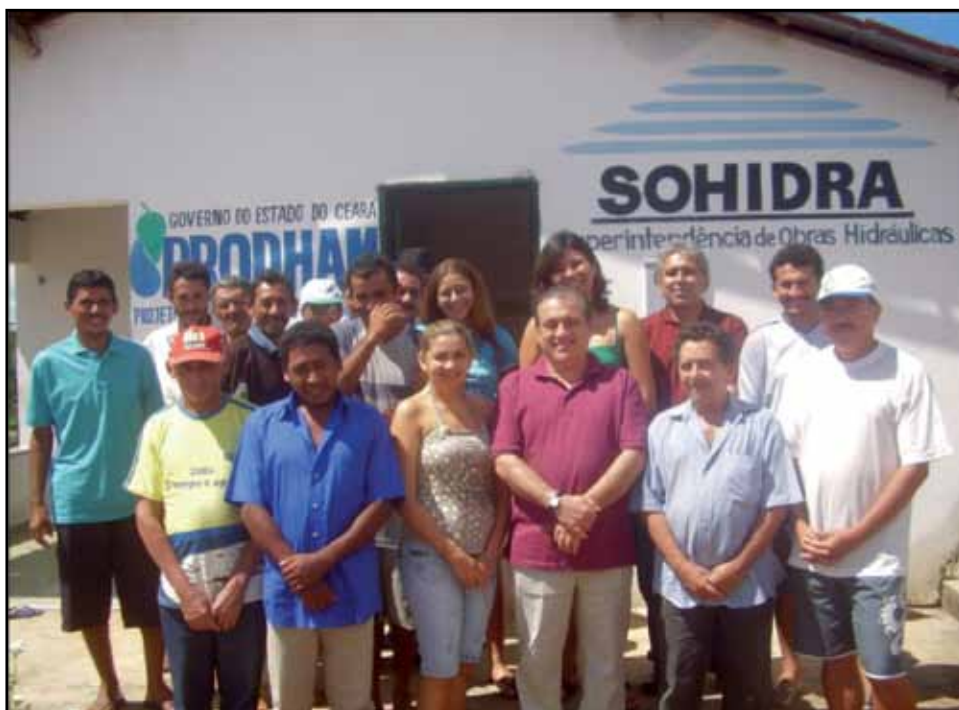
Photo 29 – End of a Focal Group Meeting in front of PRODHAM House in Iguaçú, Canindé-CE Source: PRODHAM.

a seminar of participatory evaluation of results was held. Such seminars were attended by PRODHAM implantation and supervision teams from Secretariat of Water Resources and Funceme, FAHMA technical staff, representatives of associations and families, and representatives of other social actors involved in project.