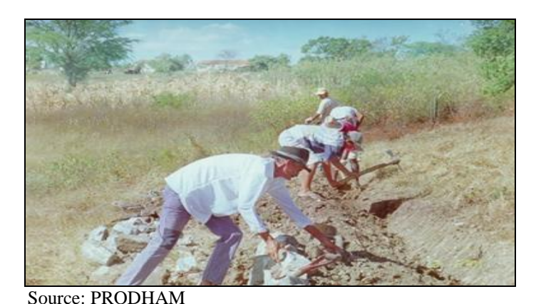
Figure 4 – Iguaçu farmers constructing a stone barrier

Local population's positive position on care with waste and the best form of explore it was disseminated. Avoiding deforestation and replacing the ciliary forest have become a habit for Iguaçu community.