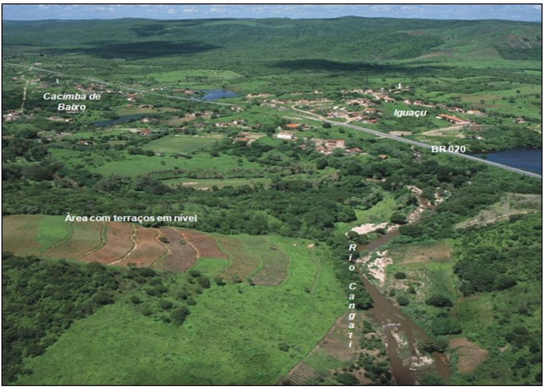
Figure 2 - Air view of Iguaçu district, Canindé-CE.