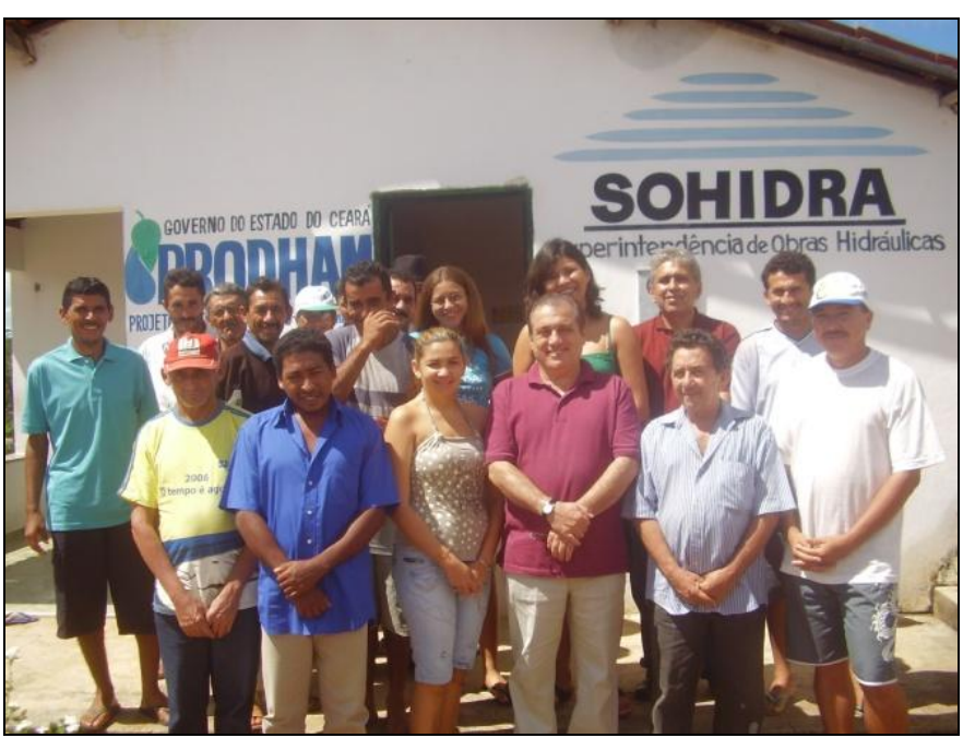
Figure 10 – Photo of closing of a focal group meeting in front of PRODHAM house in Iguaçu, Canindé-CE.