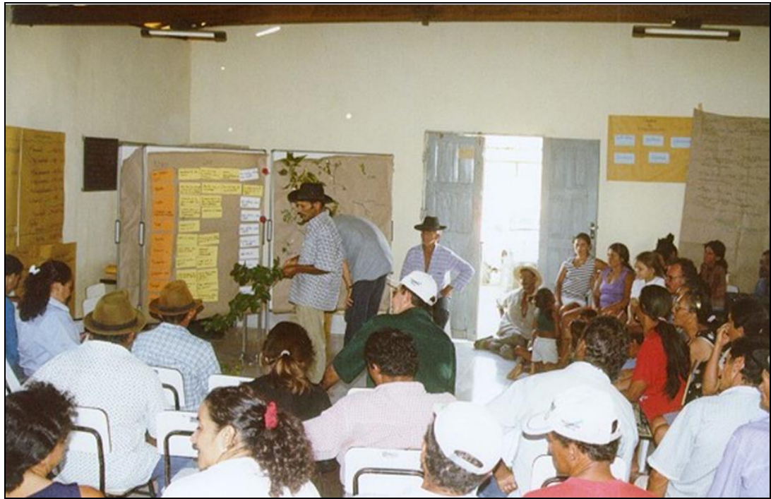
Figure 3 – Organizational capacity building event in Iguaçu, Canindé-CE.

In addition, the committee gave assistance to project management and decision making process on implementation of actions and mechanisms in the respective operation areas. It also supervised the accounts related to the agreement with the selected community association, to monitor the use of funds. All actions were strongly discussed and decisions were made by consensus (See Figure 3).