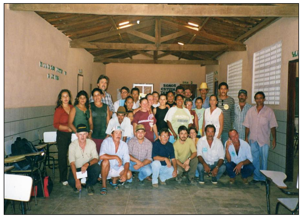
Figure 7 – Photo of a capacity building event closing in Iguaçu, Canindé-CE.

In close partnership with municipal education secretariats, a literacy system was implanted for all adults involved in project activities, which led to knowledge democratization and social inclusion process.